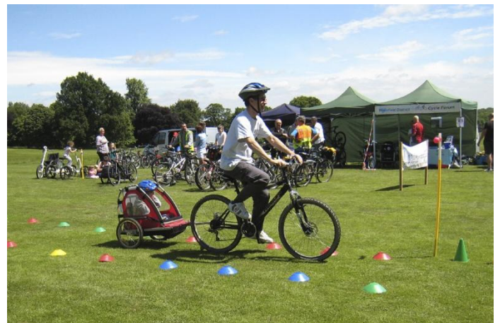
Two for the price of one on the skills course at Anglers country park