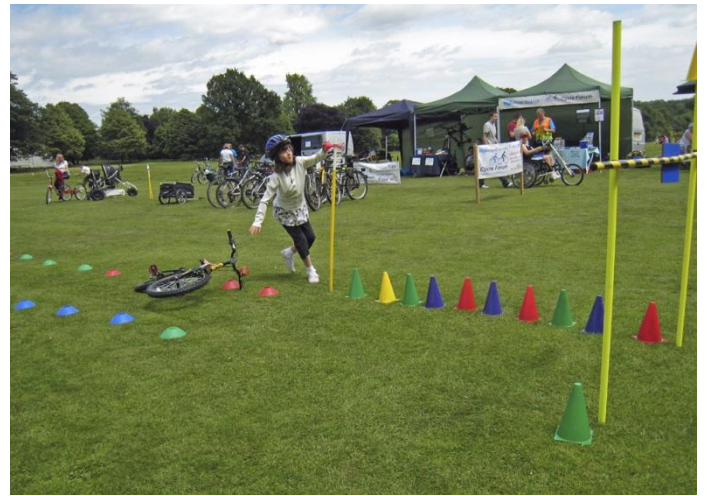
Too many cones?