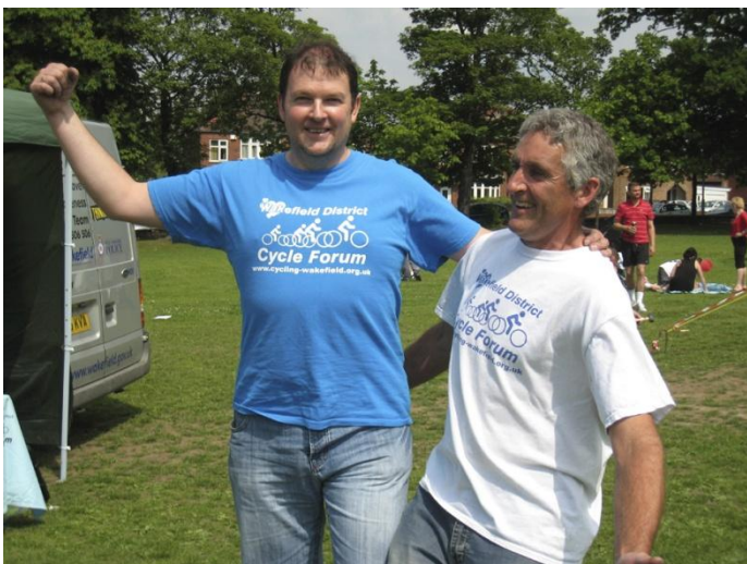
A moment of relaxation for the Bike Doctors