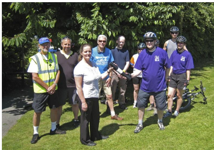
Receiving the baton at the Leeds/Wakefield border

We also ran some guided rides around the grounds at Nostell and further afield to Anglers Country Park. Around 30 people joined in the rides with a number of family groups participating. Most participants made use of the bikes we purchased with grants from the NHS and Community Foundation. We are beginning to see a number of these families return to our events and there is evidence to suggest that some of them have become regular cyclists after having started with one of our guided rides.