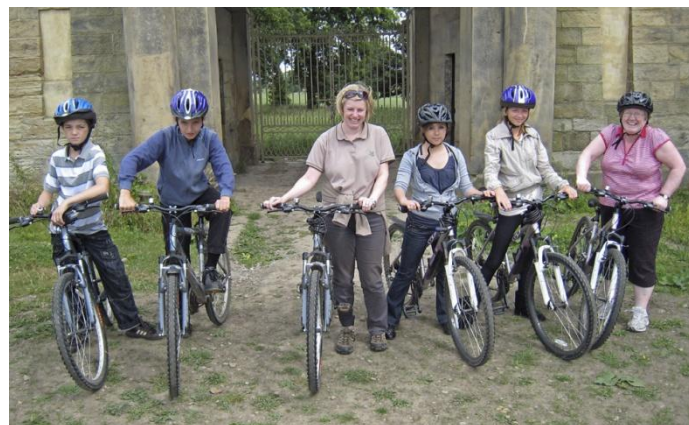
Young riders on a guided ride in Nostell Parkland

The anniversary celebrations concluded with a festival in Barnsley on Sunday 20 th June. Unfortunately we were unable to join the celebrations as we were all busy at Nostell Priory with our own big Bike Week Festival.