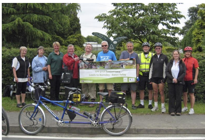
Handing over the baton to walkers at the Barnsley border