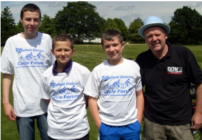
Don's Cycles Team were winners of the relay race.