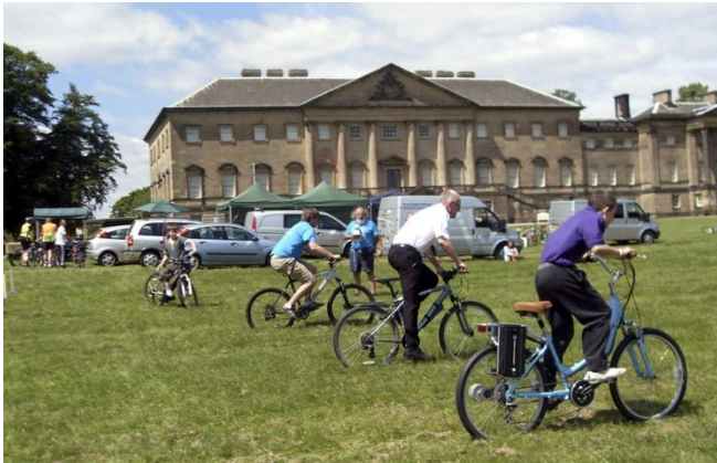
Getting ready for the relay race at Nostell Priory

Bike Week was again a busy time for the Cycle Forum this year. We ran a full programme of events at Nostell Priory to kick off the week on 19 th and 20 th June and finished with a fun day at Anglers Country Park. In between we organised two rides, one from Pontefract and one from Kirkgate Station, Wakefield.